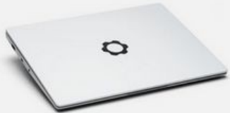
Framework Laptop 2021