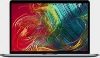
MacBook Pro 15" Touch Bar 2019 2019